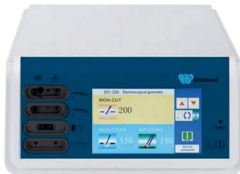
Electrosurgical Unit with Ligasure (US FDA verified)