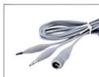
Bipolar Forceps Cable