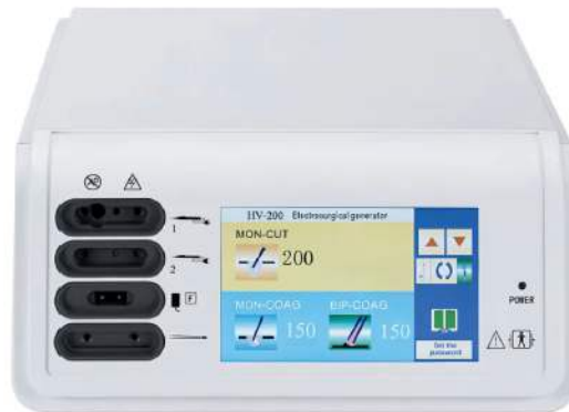
Electrosurgical Unit with Ligasure (US FDA verified)