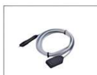
Reusable Plate Cable