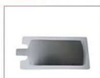
Disposable ESU Plate