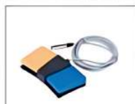
Two Button Footswitch