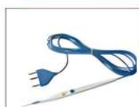
Disposable ESU Pencils