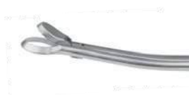
GJQ0303.3 hook punch right curved oval